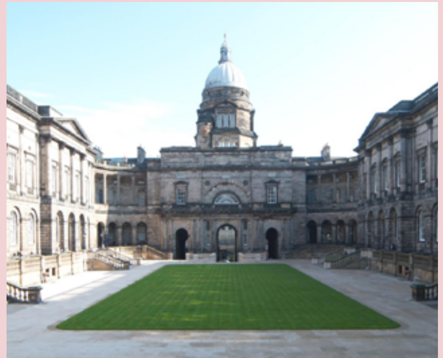
Old College 'Quad'