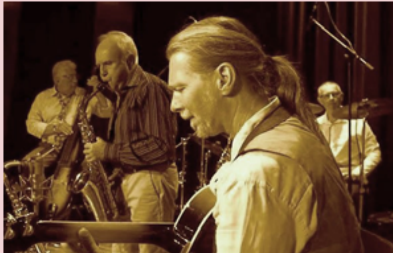
The West Coast Jazz Quartet

Gala Dinner The Balmoral Hotel Princes St, Edinburgh EH2 2EQ