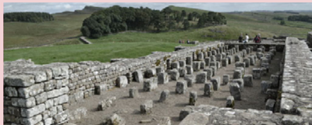
Housesteads Granary Ruins at Housesteads