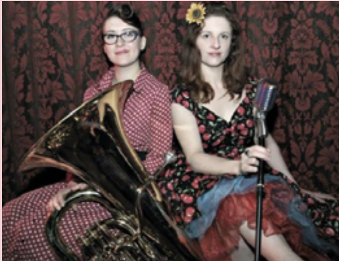
The Copper Cats