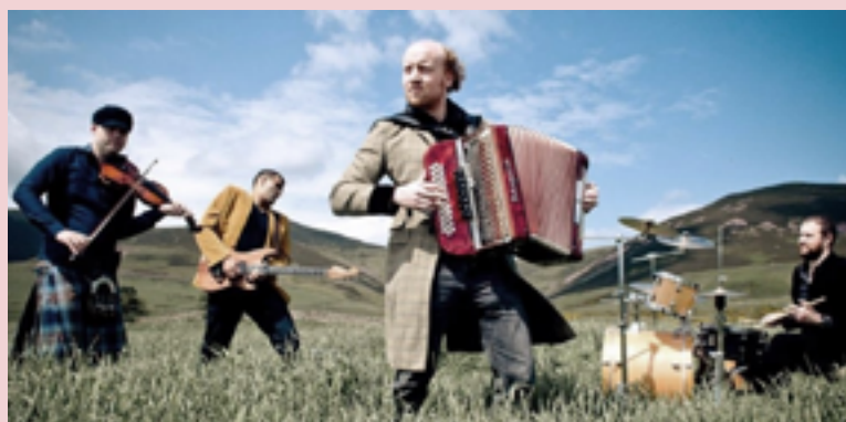
The Ceilidh Experience

Ghillie Dhu, Edinburgh 2 Rutland place, Edinburgh EH1 2AD