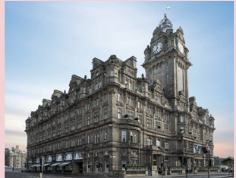
The Balmoral Hotel