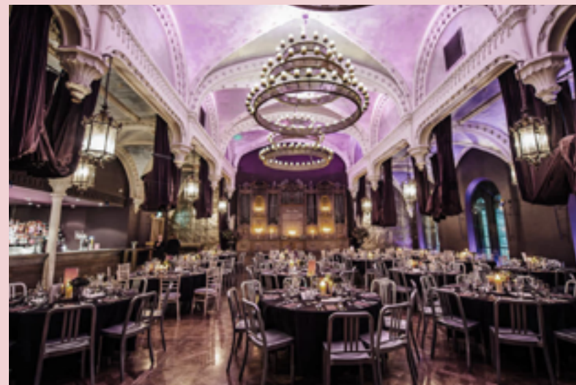
The Ghillie Dhu