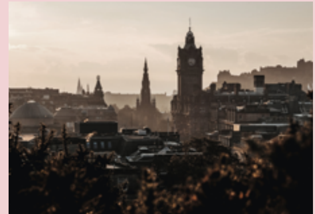
Edinburgh - View from Calton Hill