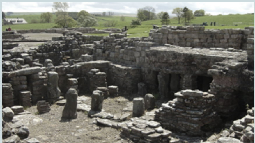
Vindolanda Bath house at Vindolanda